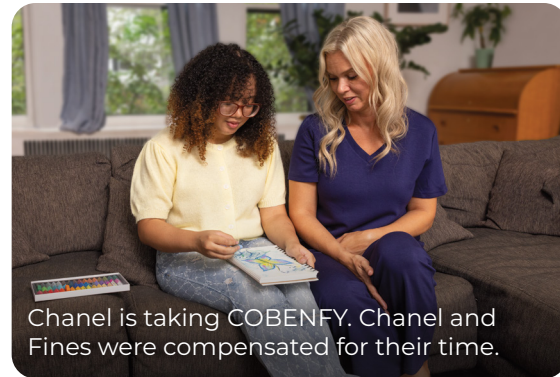
Chanel is taking COBENFY. Chanel and Fines were compensated for their time.